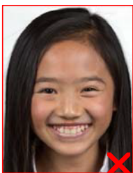
Smiling is not permitted – must be a neutral expression