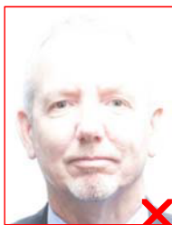
Incorrect image exposure– images cannot be too light or too dark