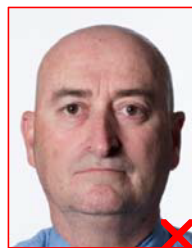
The face and background must be shadow-free