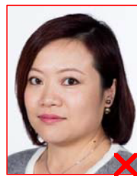
The subject must be facing forward, without any head angle