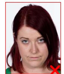
Head must not be tilted down or up